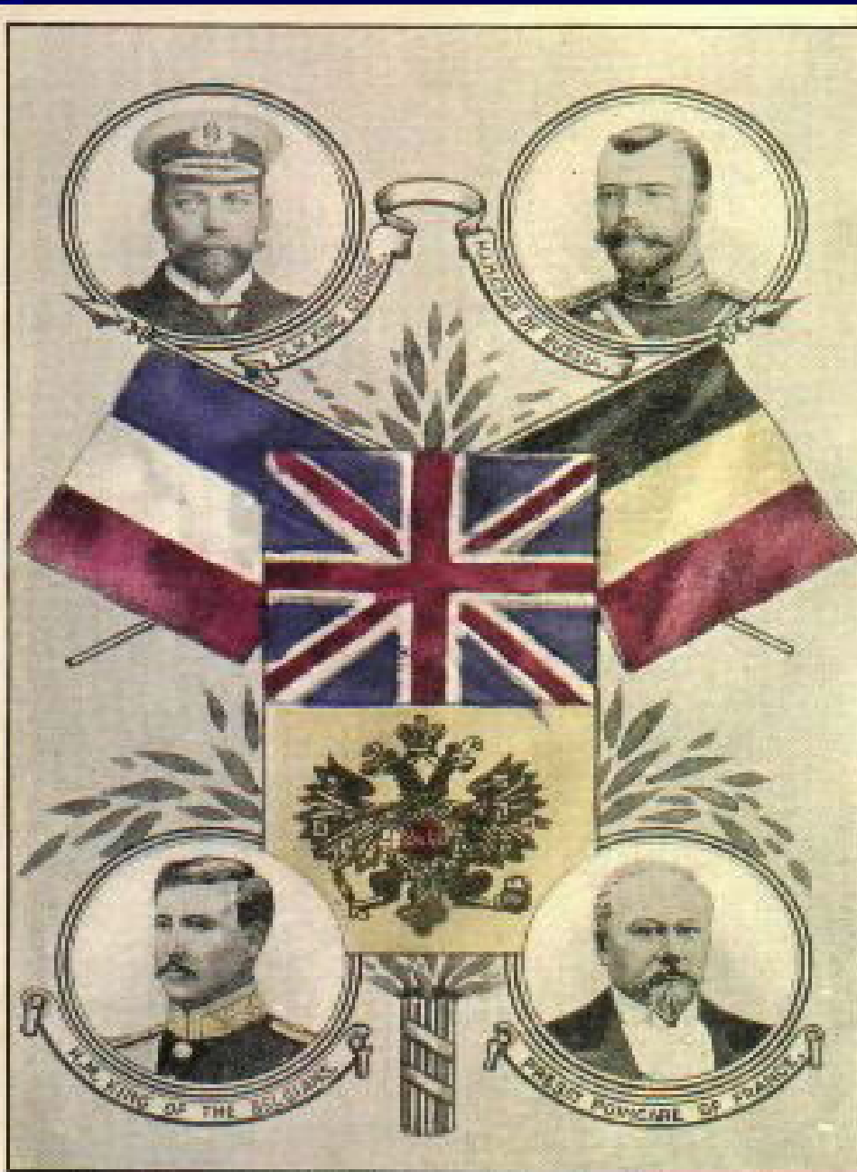
The Purchaser of this Patriotic Card subscribes One Half penny to the National Belgian Relief Fund.